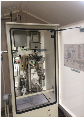
Odorizer – Injects Mercaptan into Natural Gas

The next time you smell rotten eggs in your home, business or apartment, GET OUT!